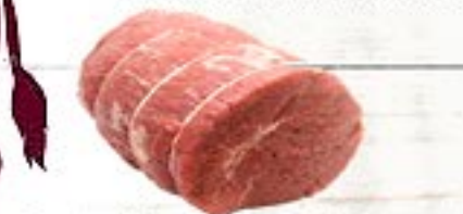
Outside Round Roast