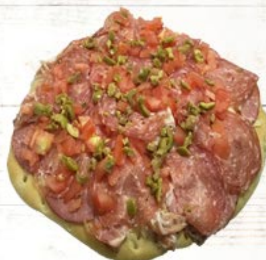
Hot or Mild Italian