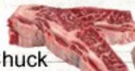
Chuck Short Ribs