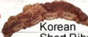
Korean Short Ribs