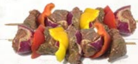
Beef Shishkabob Chipotle Beef Shishkabobs

Lean Extra Lean Triple Mix Ground Round Ground Sirloin