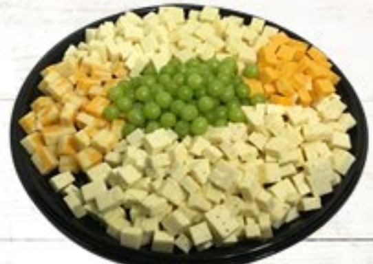
Cheese Cubed or Sliced