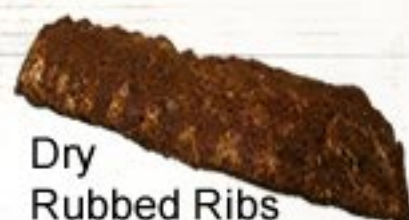
Dry Rubbed Ribs