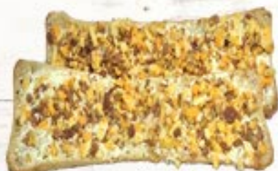
Bacon & Cheese