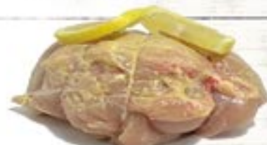
Crab & Cream Cheese