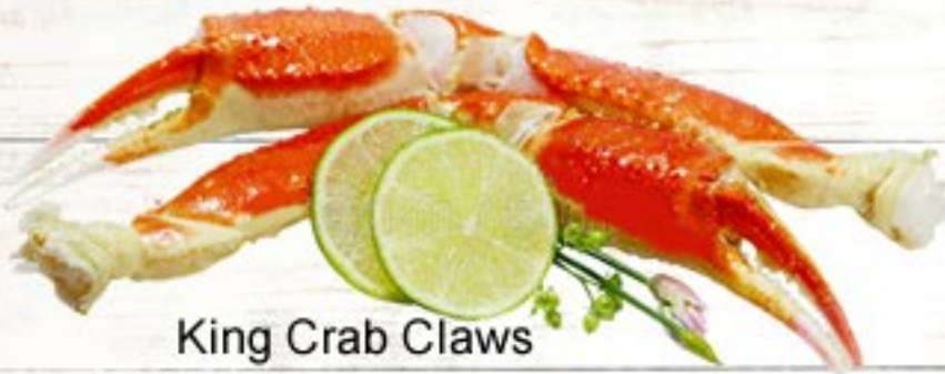
King Crab Claws