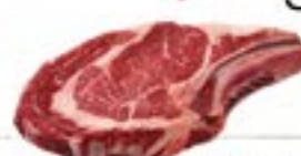
Prime Rib Steak