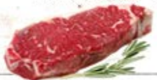
New York Striploin Steak

Rib Eye T-Bone Skirt Top Sirloin Eye of Round Inside Round Rouladen Kansas City Sirloin Boneless Blade Boneless Crosscut