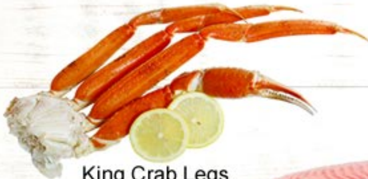
King Crab Legs