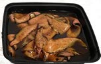
Turkey or Roast Beef with Gravy

Grilled Vegetables Pork Schnitzel Roast Beef Dinner Turkey Dinner Pork Schnitzel Dinner