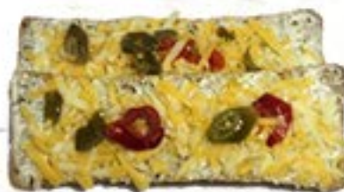
Cheese & Hot Pepper