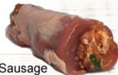
Sausage Stuffed Tenderloin