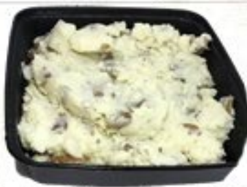
Garlic Smashed Potato