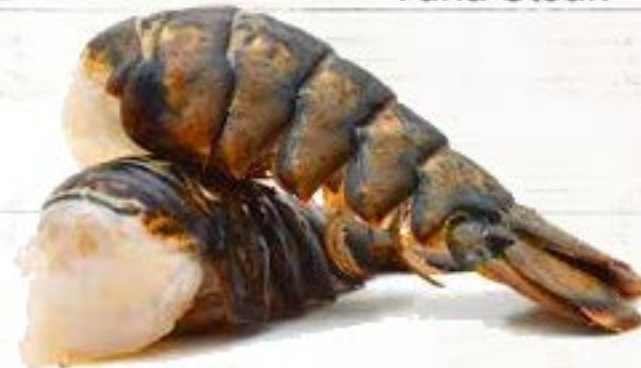
Lobster Tails 8oz, 12oz & 20oz