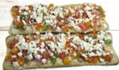
Bruschetta With Feta or Marble