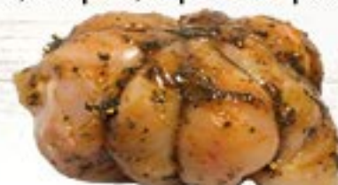
Broccoli & Cheese