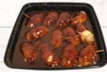
Bacon Wrapped Sausage