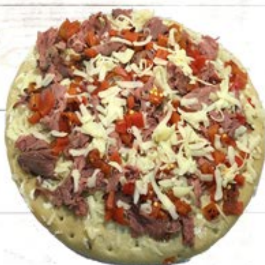
Roast Beef & Red Pepper