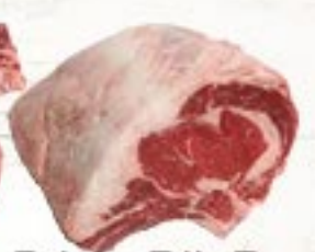
Prime Rib Roast