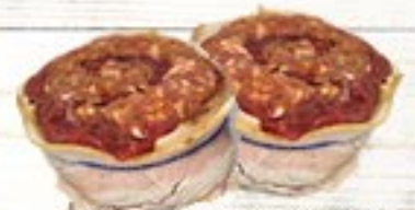
Bacon Wrapped London Broil

Lean Beef Burgers 4, 6 & 8 oz. Texan Jalapeno & Cheddar Cheddar & Onion Chipotle Great Canadian Burger