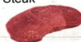
Sirloin Tip Steak