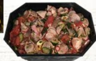
Watermelon & Radish