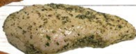
Lemon & Herb