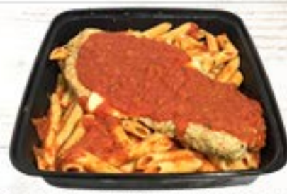
Chicken or Veal Parmesan with Pasta