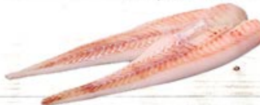
Alaskan Pollock Fillet