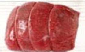
Sirloin Tip Roast