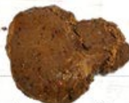
Marinated Butterfly & Centre Cut Chilli Lime, Orange & Maple Ginger