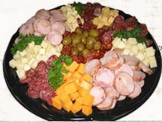
Cubed Meat & Cheese