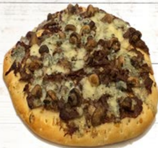
Steak with Blue Cheese