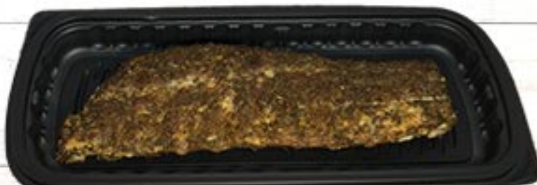
Pork Back Ribs, Seasoned & BBQ